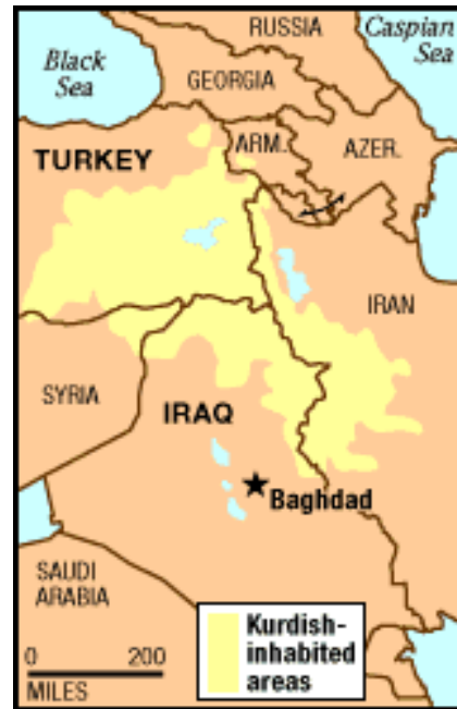
THE WASHINGTON POST

generally known as Kurdistan , "Land of the Kurds," although Kurdistan is not a sovereign nation. 15 million to 20 million Kurds live in a mountainous area straddling the borders of Armenia, Iran, Iraq, Syria and Turkey. About 8 million live in southeastern Turkey. Because the Kurds are an ethnic minority in the countries that they live in, they are often face discrimination and hatred.