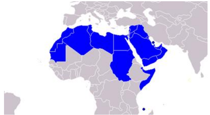
Map of Arabic speaking countries

Therefore, language is an important characteristic of what it means to be Arab. The Arabic language was spread by the Muslim conquests, in part because the Qur'an must be recited in Arabic, and the essential prayers of Islam are said in Arabic. Arab speaking people range from North Africa to Iraq.